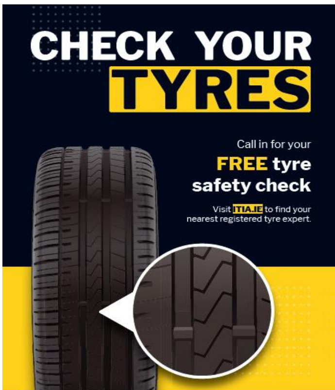
Retailer Poster Version 1: